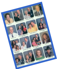
PHOTO DIRECTORY NEWS

Thank you to all the parishioners who participated in our parish photo directory. We had a very good turnout and that makes a more complete directory. We also want to thank the many volunteers who managed appointments, gathered information, took group photos and designed the pages.